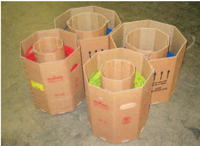
Delivery for one-way barrel